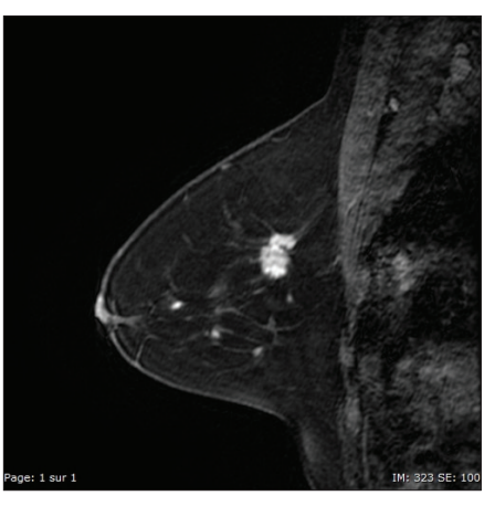
Figure 1. Sagittal VIBRANT<sup>®</sup> image of an invasive breast carcinoma.

Two radiologists (a junior physician with 6 months of breast MRI experience, and a senior physician with 5 years of experience) individually reviewed the images in two stages separated by at least two weeks with randomization so as to limit all bias. Abbreviated and complete protocols were mixed in the two stages. For both stages, the readers had access to the previous examinations and clinical information, but not to the later examinations, current breast MRI report, and later possible anatomopathology analysis or imaging follow-up. For every reader, the order of the two stages was randomized and the reading of the abbreviated protocol was blinded from the reading of the complete protocol. For each breast, the readers indicated the size, the quadrant, the type of lesion in case of anomaly, and the ACR BI-RADS classification. The duration of read outs were also noted. The BI-RADS classifications were then compiled according to the implication